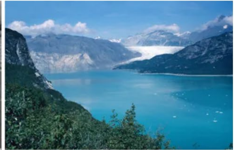
Muir & Riggs Glaciers, Alaska: 1941, 1950, 2004